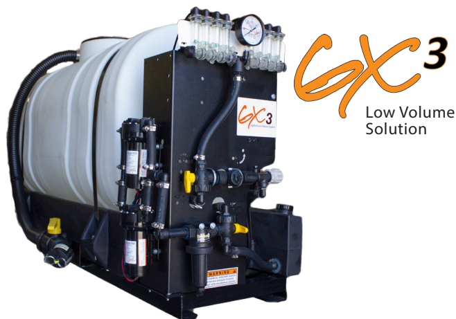
Low Volume Solution