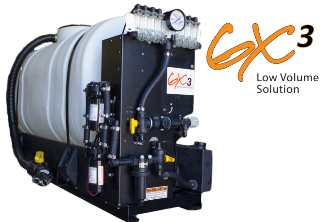
GX3 Low Volume Solution