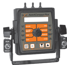
AutoX- Compact Plus