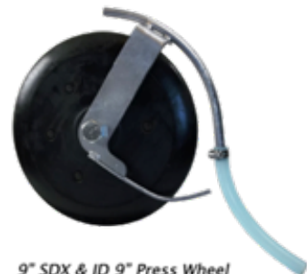
9" SDX & JD 9" Press Wheel

This applicator tube is designed to deliver liquid fertilizer behind the press wheel. The press wheel presses seeds in before fertilizer is placed above the seed thus creating a clean application of fertilizer as it applies the liquid behind the drill. It can also be adjusted to fit your conditions in the field. Various field conditions require a specific setup of this tube.